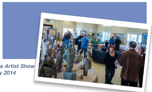
Paa-ko Fine Artist Show May 2014