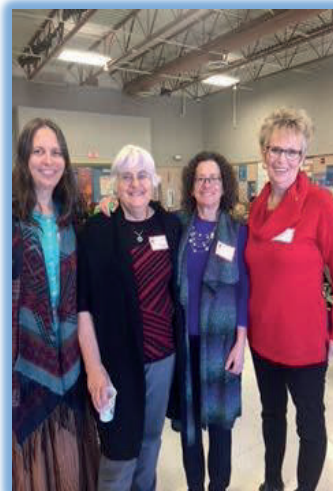
Womenade Board Members attend the 2017 Garden Club holiday potluck.

In December 2017, members of the East Mountain Garden Club gathered for their annual holiday potluck luncheon. For the 12 th consecutive year, club members have chosen to make individual holiday contributions to East Mountain Womenade during their holiday luncheon. In 2017, their contributions totaled an impressive $3,135. Thank you so much for your generous donations.