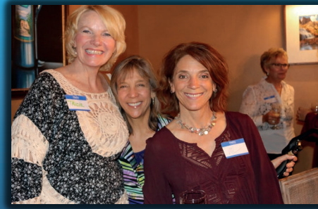
Womenade Annual Fall Potluck, September 2017